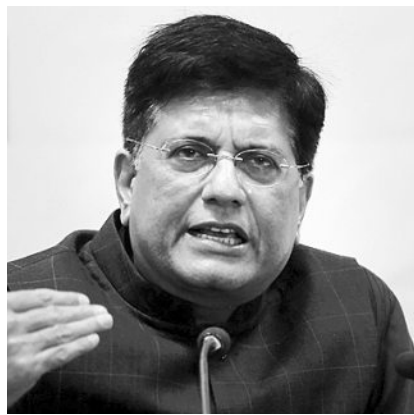
SUBHAYAN CHAKRABORTY New Delhi, 21 July

Commerce Minister Piyush Goyal says India is willing to have an 'early harvest trade deal' for 50-100 export products and services