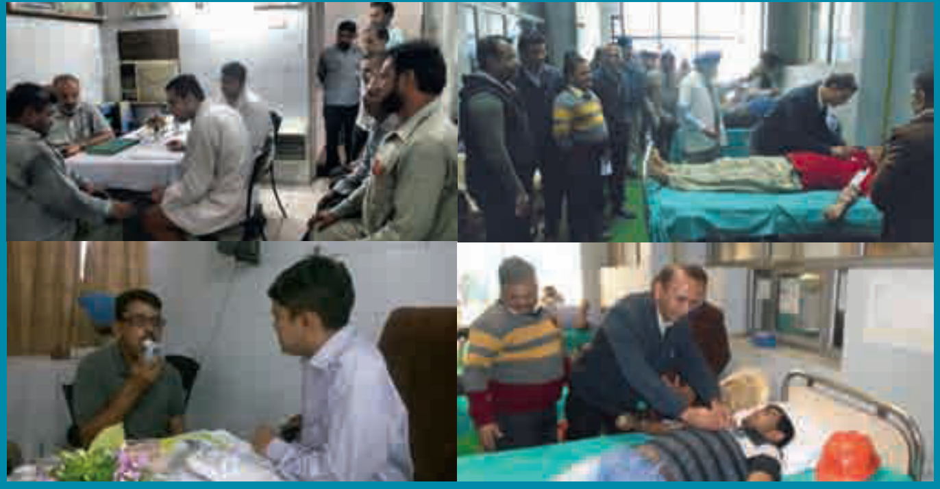
Health Checkup Camp 2016